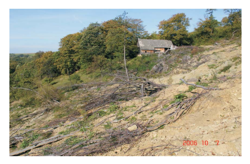
Fig. 2. Landslide in the Western Carpathians

The temporal incidence of the mass movement is strongly correlated with the climate. During wet years, or soon after, an increasing number of fresh or revitalised landslides is reported. Such a situation took place after heavy rainstorms and flood in summer 1997. Since that time, numerous landslides in the Polish Carpathians were activated. Serious damages of houses and the communication infrastructure were reported (Fig. 2). Over 20,000 landslides were registered until 2003.