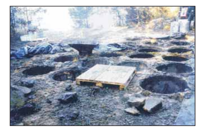
Fig. 3. Terrain of repository after excavation, before liquidation of stable conctrution

A different liquidation method was applied for repositories located in the military fortifications. The chamber walls were cleaned there, only, without liquidation of a tomb stable infrastructure.