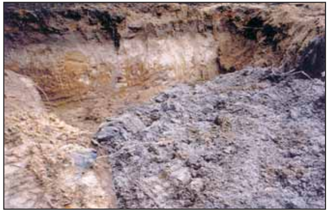
Fig. 4. Filling of empties with natural minerals