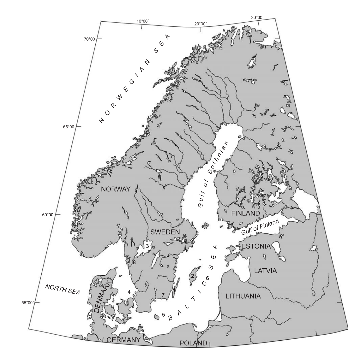
Fig. 1. Location map of the Baltic Sea area

3 m/s such a channel could 'swallow' all outflowing Ancylus water, without using the Göta Älv outlet. It is, however, very likely that the latter outlet functioned together with the Dana River in the initial stage. Depending on highly varying channel widths and depths this would have created a variable fluvial environment along the Dana River. This is also documented by Bennike et al. (2004) unit H1 in the Great Belt: it consists of lake, levée and fluvial deposits, showing initial erosion at some places and indications that the channel was filled up to critical depths at other places. A major fresh water