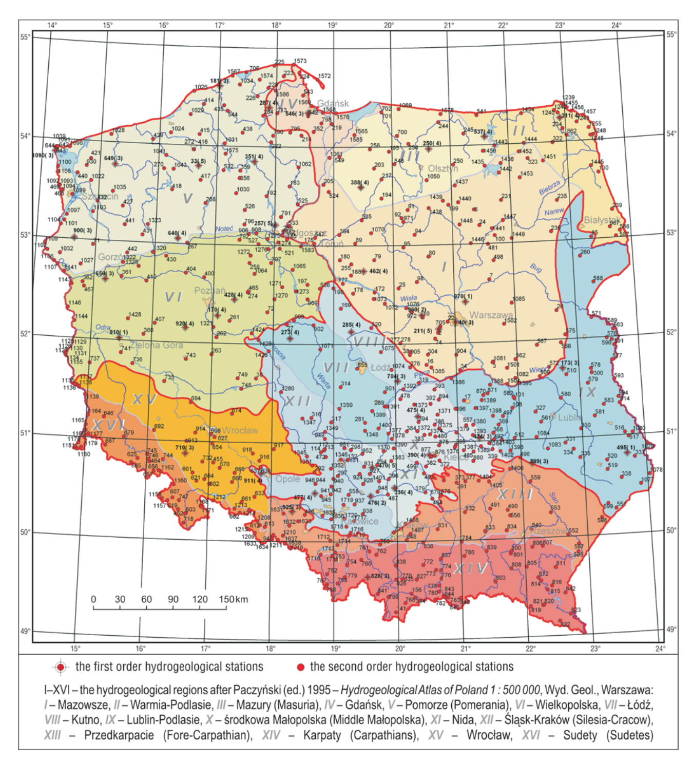
Fig. 4. Location of the PGI-NRI groundwater monitoring hydrogeological stations (PHS material)

Reports on groundwater assessments and/or changes in the availability of groundwater resources are prepared by order of the Ministry of the Environment and, at their request, they can be distributed to other national government departments and institutions or can be used to prepare reports for the European Commission.