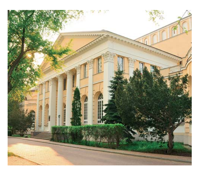
Fig. 1. Headquarters of Polish Hydrogeological Survey (Polish Geological Institute – National Research Institute, Warsaw).