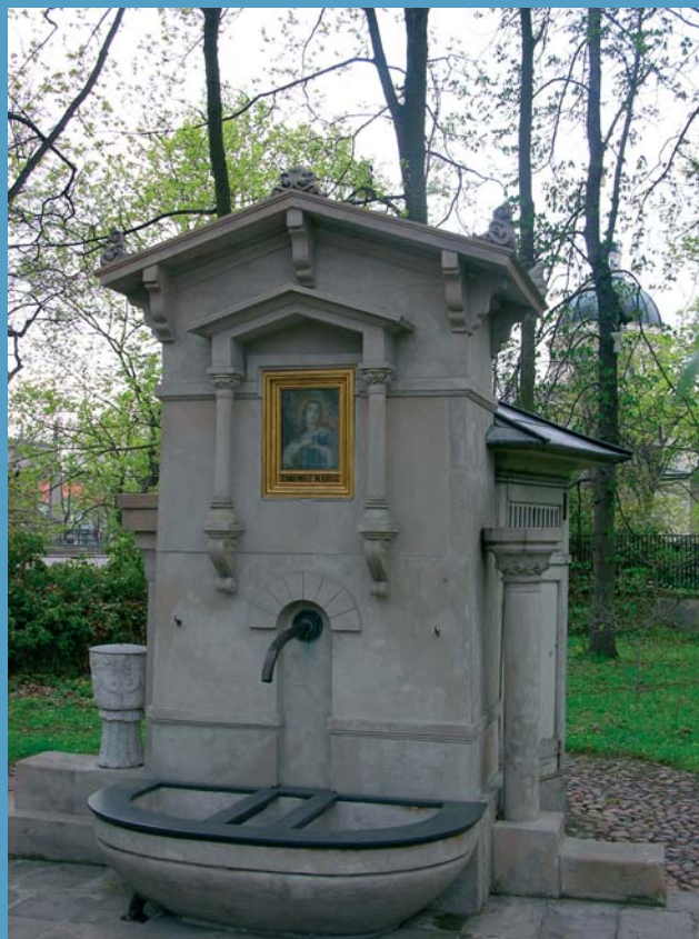
Fig. 4. Warsaw Wilanów. A well of the year 1809, with painting of the Holy Mary by Z. Strzelecki (from the middle of 19th century)