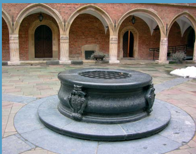
Fig. 3. Collegium Maius, Cracow. A well of 1517 in the center of a vast courtyard of the late-Gothic edifice. An ornamental rim made of black Dębnik marble was added in the years 1950s