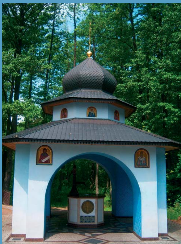
Fig. 5. Grabarka. A water well of ca. 1948.