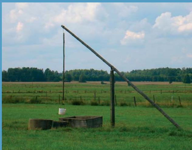
Fig. 2. Dug wells called cranes are still common elements of landscape in Podlasie (east of Poland)