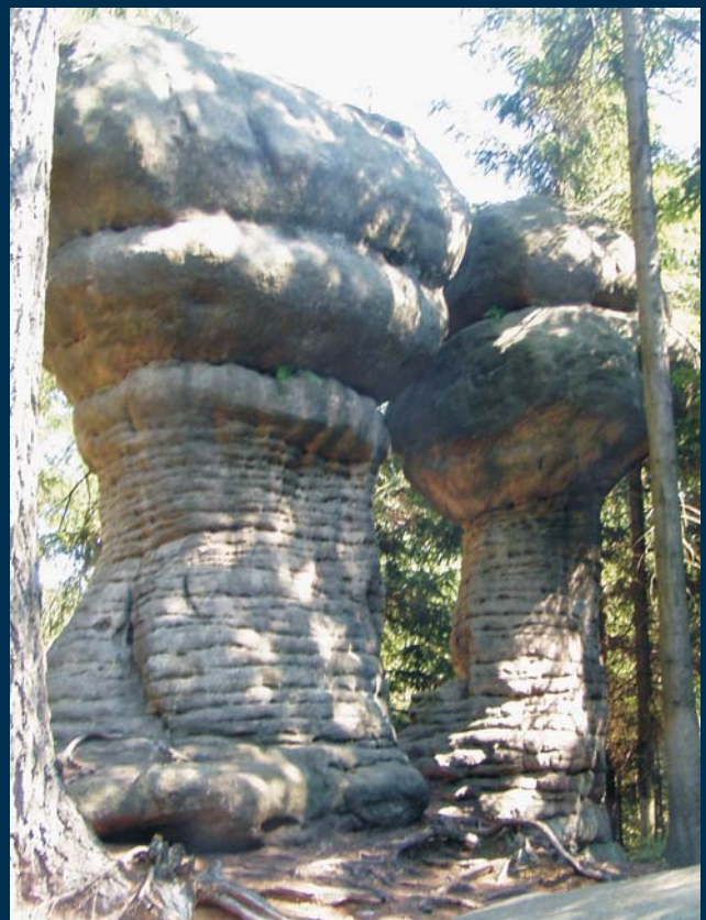
Fig. 15. The rocky mushrooms.