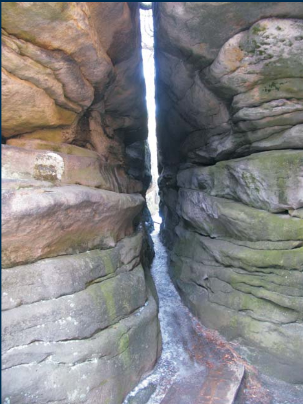
Fig. 12. The Rock in Błędne Skały. Figs. 12, 13 photo by F. Nowacki