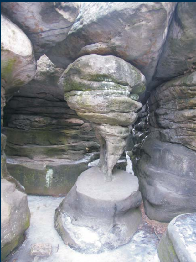
Fig. 13. One of the most characteristic rocks in Błędne Skały — the Chicken Foot